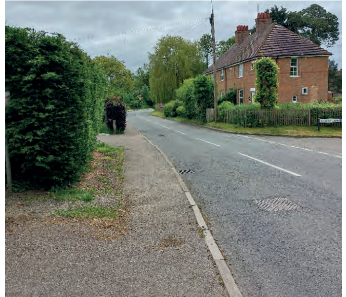
● The East West Railway will run close to this section of Wilden High Street.

Councillors, parish councils, kept in the dark. But you were kept in the dark too. East West Rail put that consultation out in 2019 and halfway through they decided to spin all the numbers around in terms of the costs and